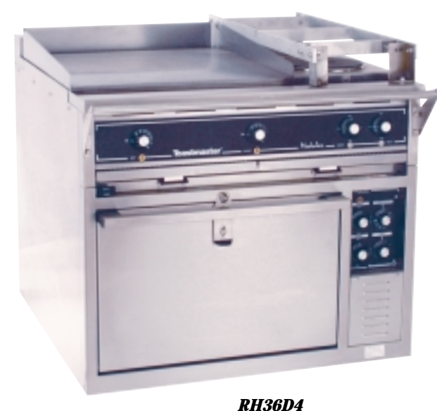
with deck oven base and optional casters